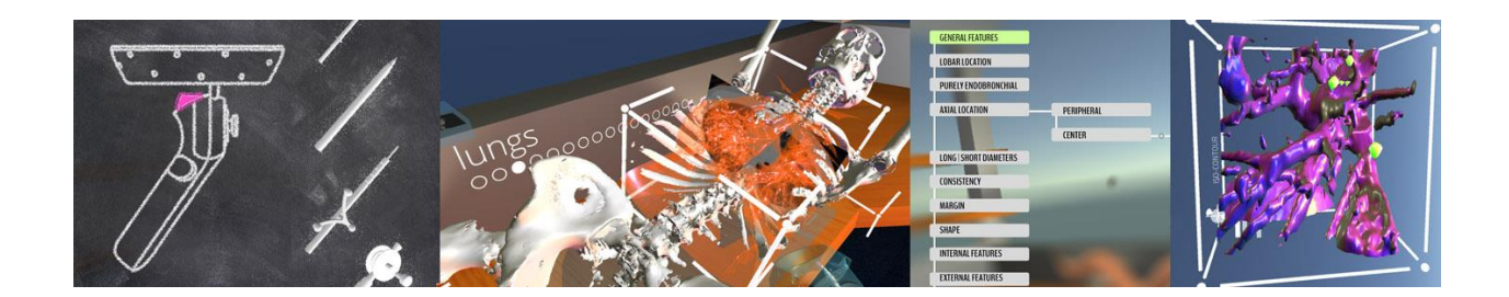
FIGURE 2:EDRN VIRTUAL REALITY PROTOTYPE FOR EXPLORING MULTI-DIMENSIONAL IMAGING DATA